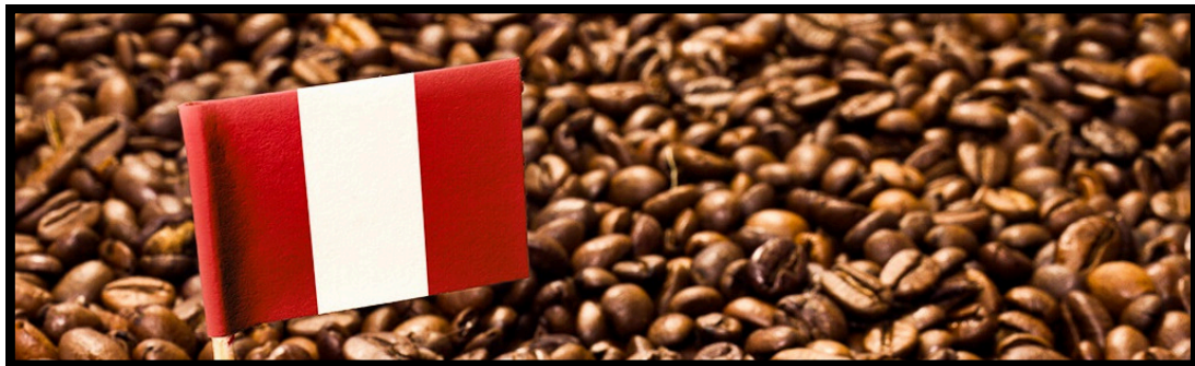
REGIONS OF PERU